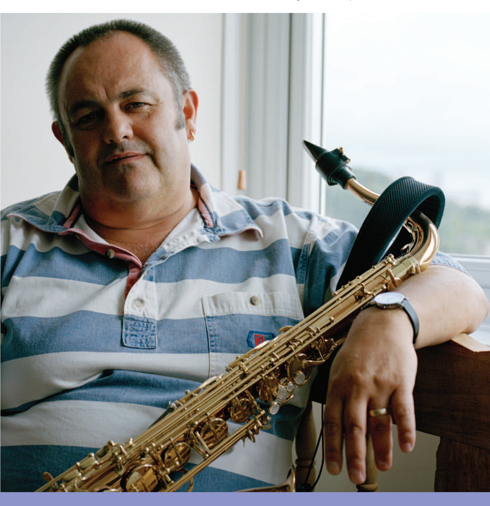
66 I'm now working in partnership with NHS staff and service users to promote the concept and understanding of Recovery within Mental Health Services. ??