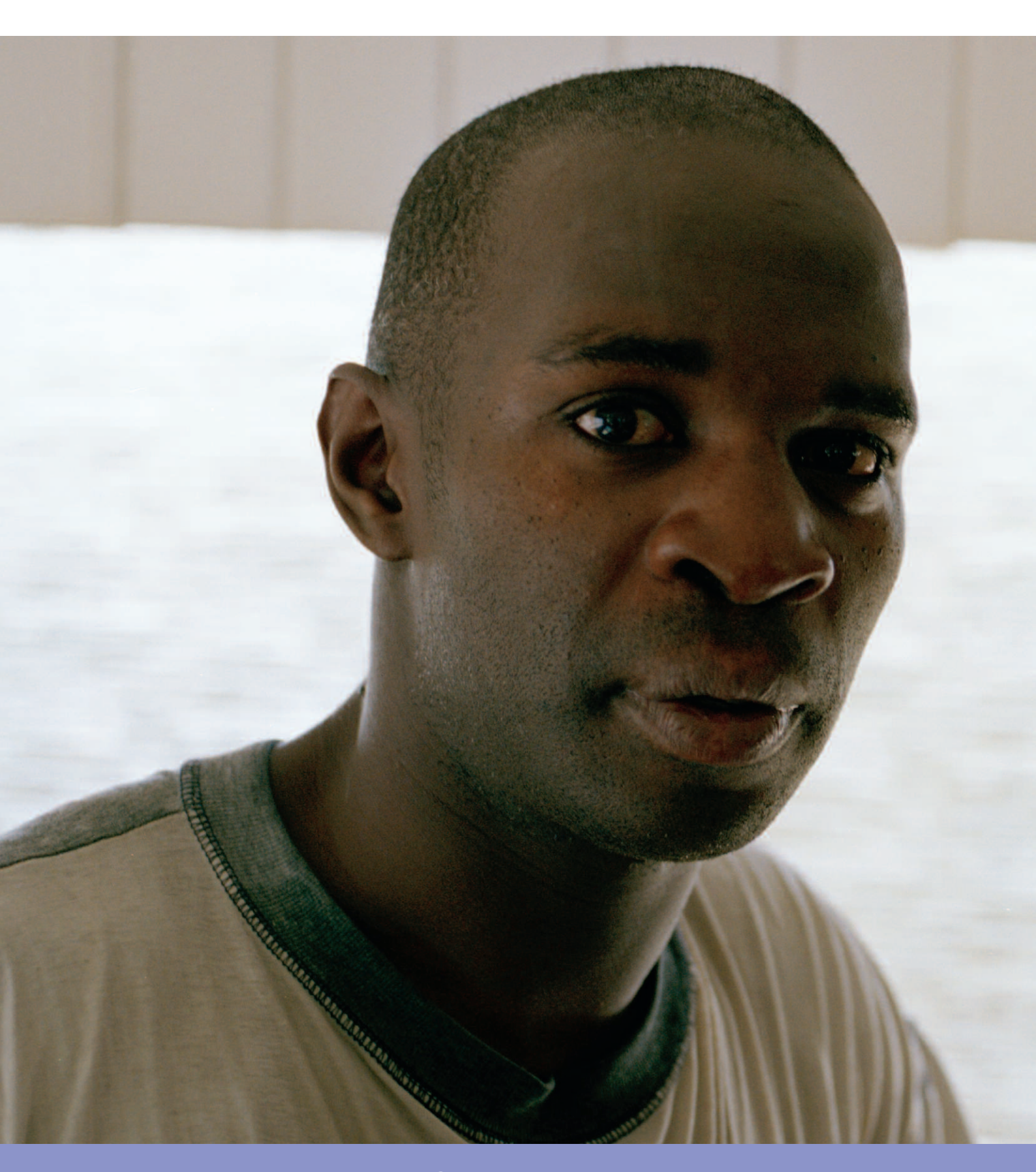
66 Stay in the gym! >>