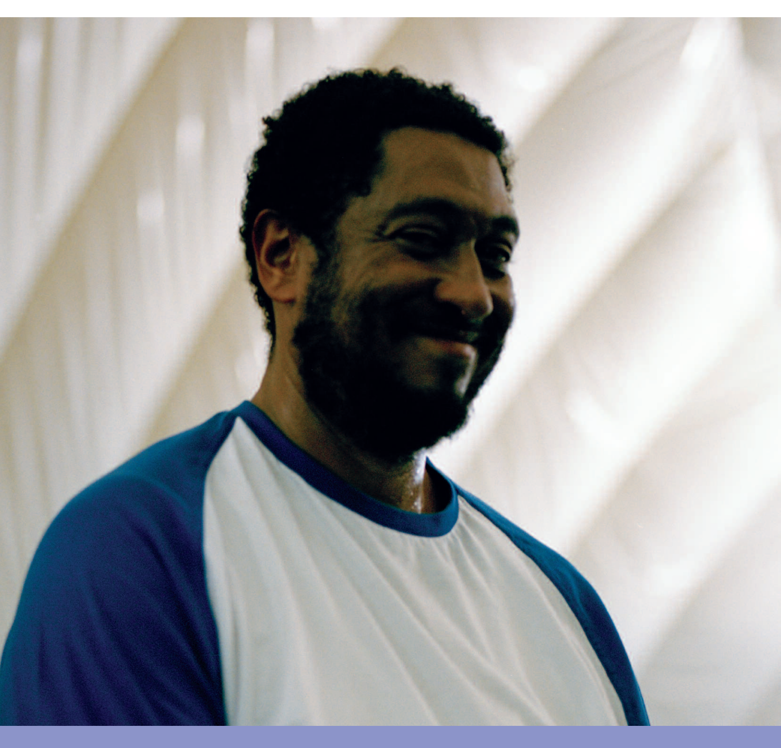
** Taking part in things is important for me to change my life and look after my wellbeing. It is important for me to keep myself going, and I enjoy the gym, football, and volunteering on the allotment. **